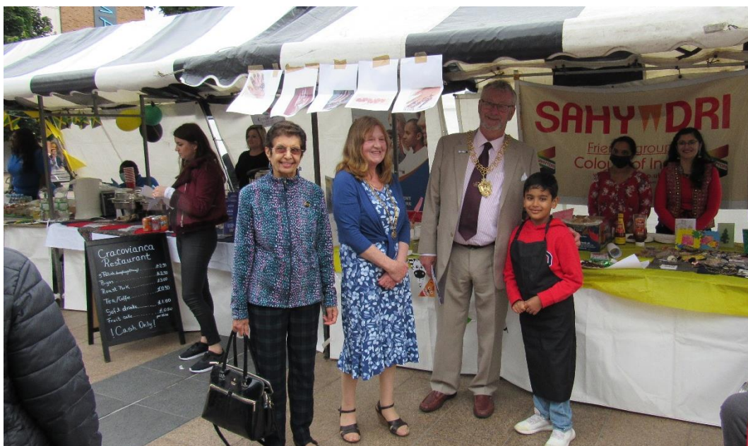
The Lord Mayor and Lady Mayoress visiting stalls