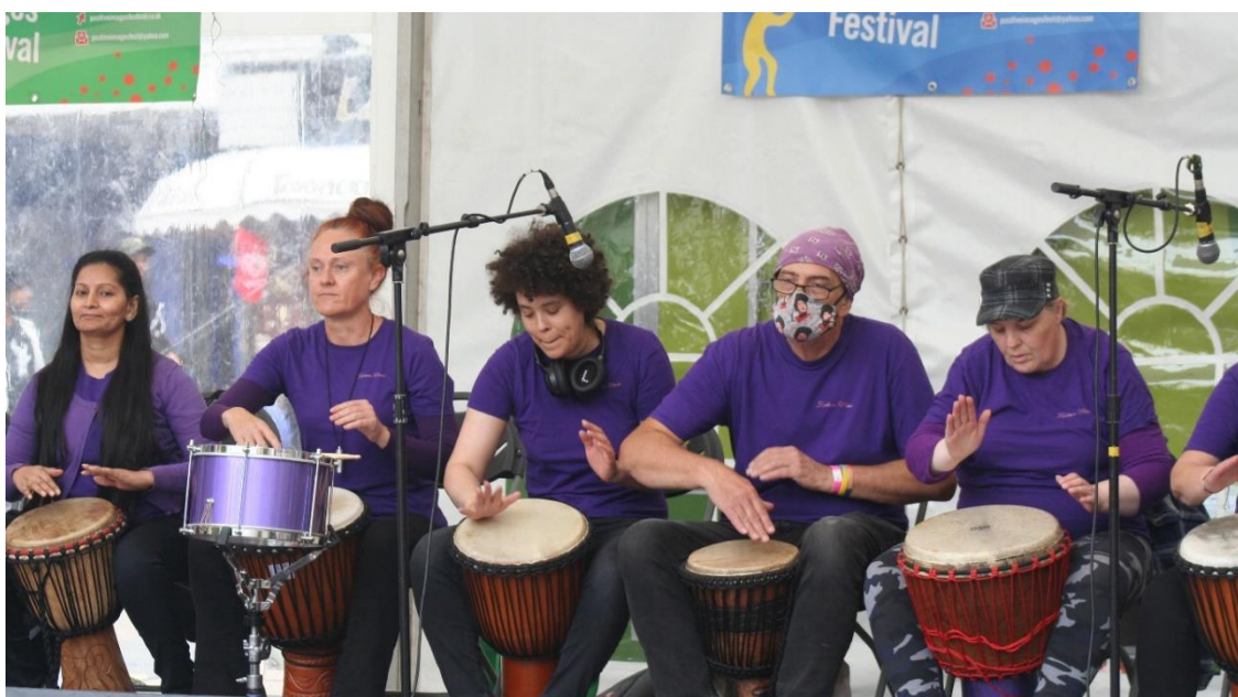
Kadence Music drummers

An extremely positive comment was passed on to us by one of the stallholders: "The public fed back how much they had enjoyed the event. Quite a few visitors to our stall were from out of town - Leamington Spa, London and Rugby. They were visiting Coventry and to see our stalls there was an unexpected surprise. Coventry residents said the same - an unexpected surprise." (Detailed report available on request)