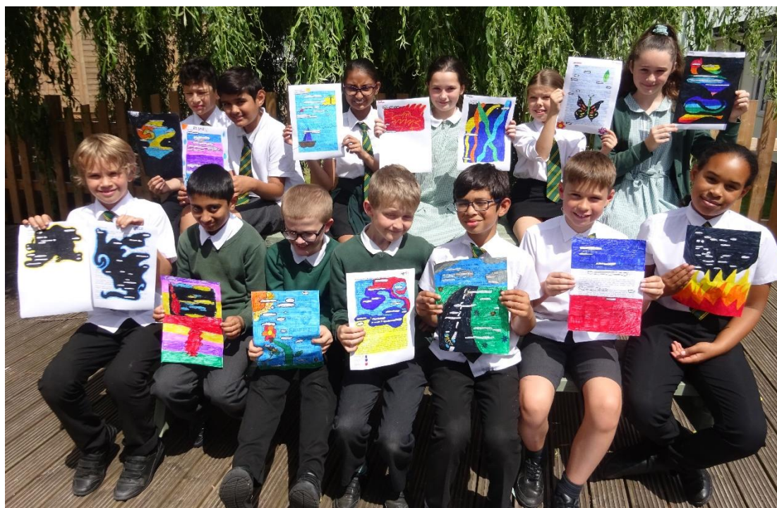
Pupils proudly displaying their Blackout Poems